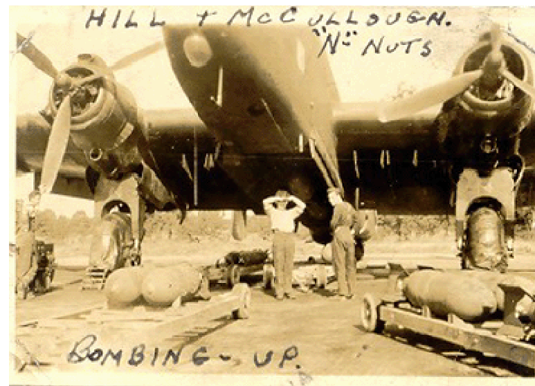
WL "N" Nuts Hill & McCullough bombing up "N" Nuts