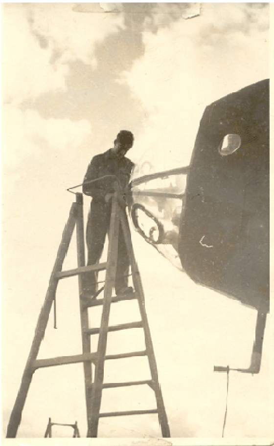
A top the ladder at Tholthorpe, Yorkshire 1944 cleaning the machine gun in the nose of a halifax bomber.