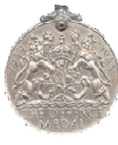
Defence Medal Back