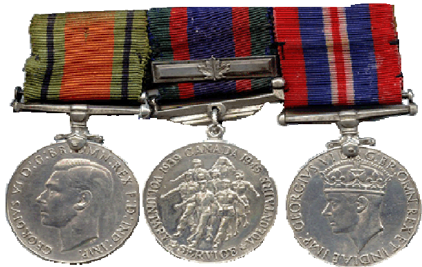
Defence Medal, Voluntary Service Medal, War Medal

Sadly, my uncle passed away after a long illness with cancer on January 12, 2001. He will always be remembered by his family.