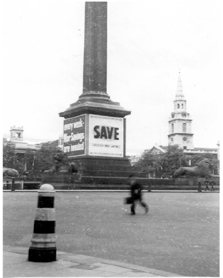
This picture of Trafalger Square was taken while on leave in London 1944