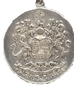
Voluntary Service Medal Back