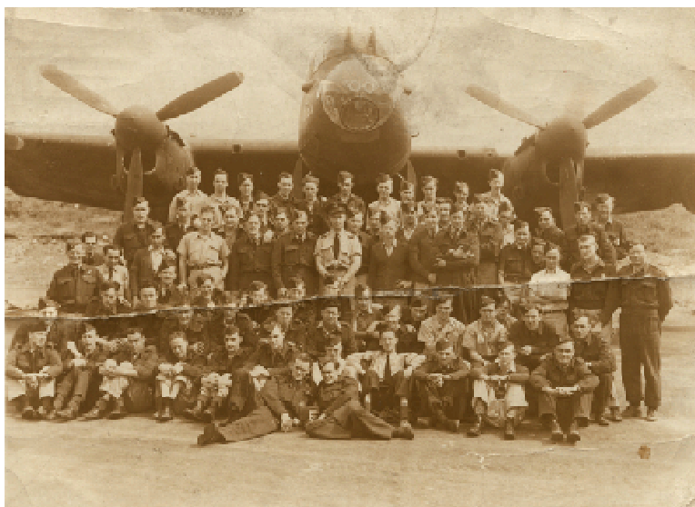
Bomb Armourers Of 434 Squadron (Blue Nose Squadron)