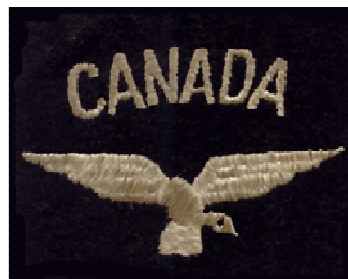
R.C.A.F. Shoulder Tittle