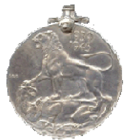
War Medal Back